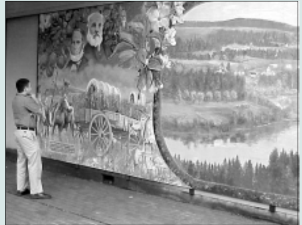
The mural took two weeks to complete, and is 36 feet wide and nine feet tall.

and the Festival-goers can plainly see the giant mural, and that's why he de-