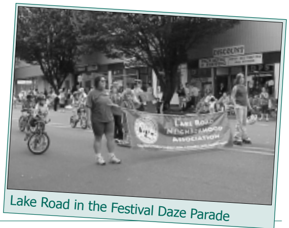
Lake Road in the Festival Daze Parade

Housing choices will also dictate traffic conditions. That's why design guidelines are an important part of this along with preventing negative results of density, which can cause people to move out of the cities. We can't make it a perfect world, but that shouldn't stop us from improving things. There isn't going to be one solution to our crowded roads, but varied solutions starting with each person make the best choices.