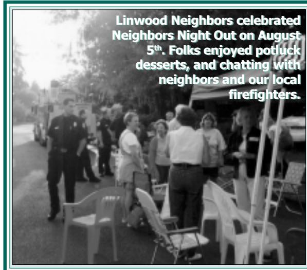
Linwood Neighbors celebrated Neighbors Night Out on August 5 th . Folks enjoyed potluck dinners, and chatting with neighbors and our local firefighters.

Our next meeting will be held Sept. 11 th , 7 p.m., at Linwood Elementary School Library. See you there!